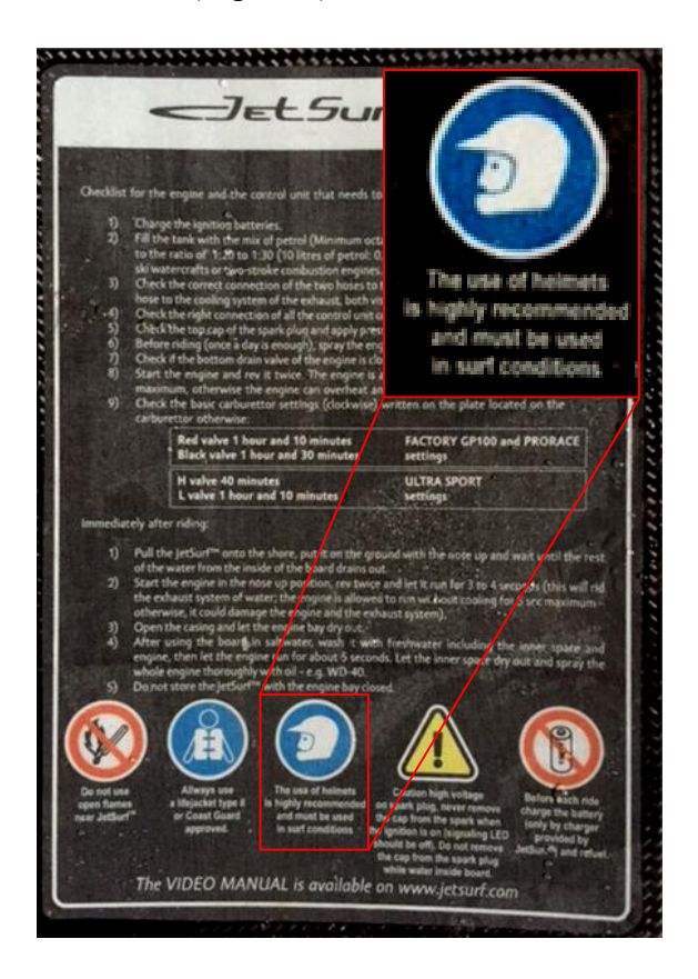
Figure 4: Safety symbols displayed on the surfboard

been successful. Nonetheless, the jet surfboards came with an illustration of five key symbols and a checklist for the engine and control unit. One of the symbols displayed a graphic image of a helmet with a caption 'the use of helmets is highly recommended and must be used in surf conditions' (Figure 4).